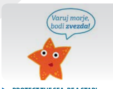
▶ PROTECT THE SEA, BE A STAR!

to recognize outstanding contributions made toward the protection, conservation, and improvement of Adriatic's natural resources.