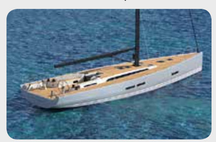
Performance over 41 up to 60 ft