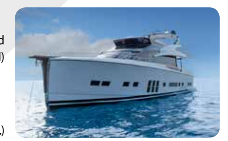
► Adler Suprema 76

(innovations, new technologies, ecology etc.)